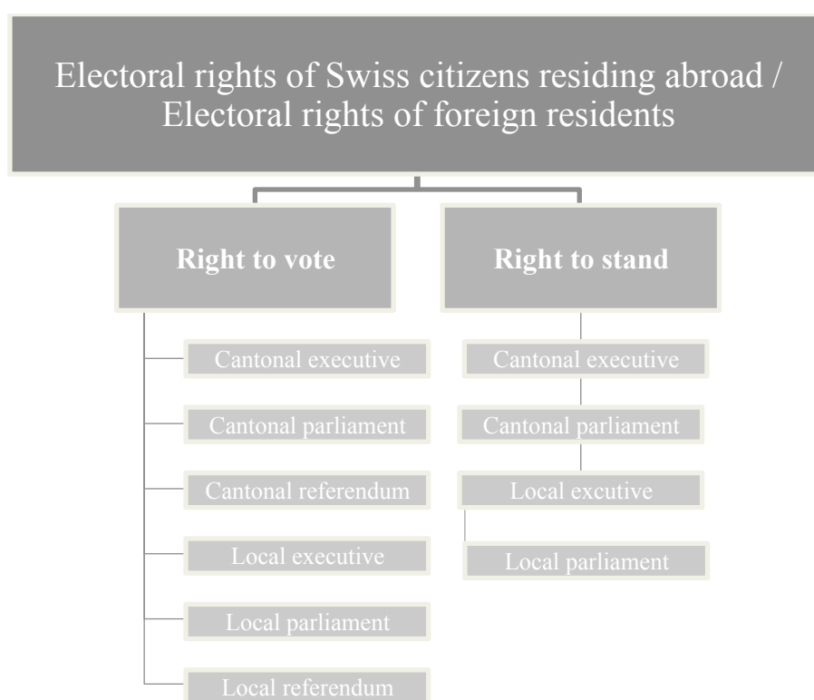
Figure 2. Conceptual Tree: Electoral Rights of Swiss Citizens Abroad and of Foreign Residents in a Given Canton