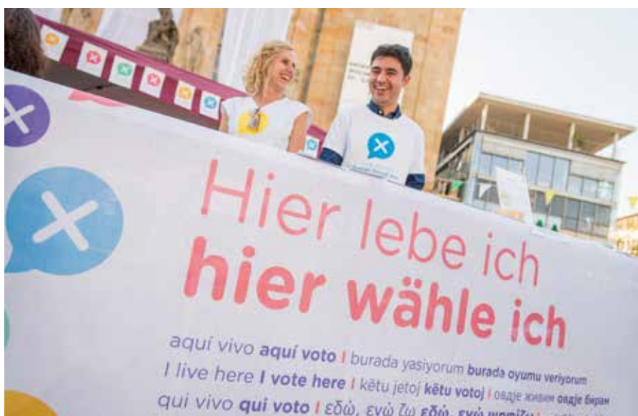
Picture: Campaign Freiburger Wahlkreis 100%

One way of addressing the democratic deficit in terms of voting rights is through local initiatives and collective actions. We found that this concerns not only migrants without voting rights, but that activist groups include people with and without voting rights and with various migration backgrounds. From the perspective of an inclusive society and sustainable democracy, such struggles and their arguments deserve attention both of policy makers and citizens with political rights.