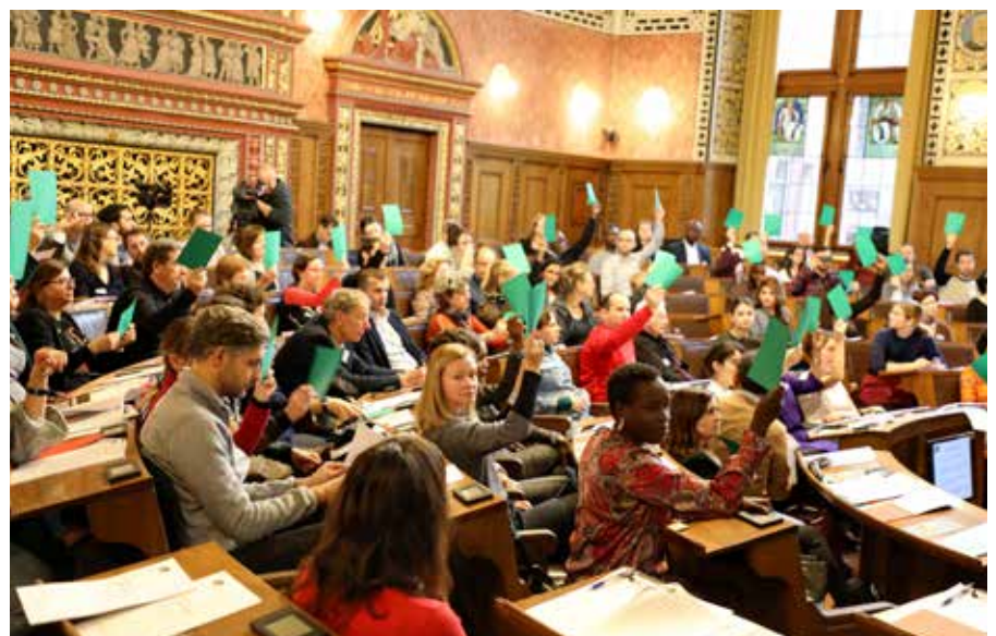
Picture: Migrant*innensession 2019 in Basel, Verein Mitstimme

Citizenship rights have been negotiated and fought for, and consequently have been transformed greatly over time. In