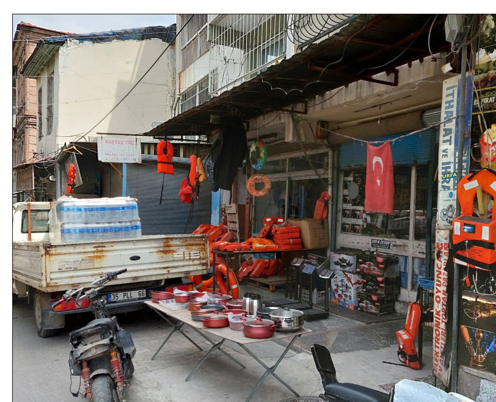
Shop selling kitchen utensils and life jackets Photo taken during fieldwork in Izmir, Turkey